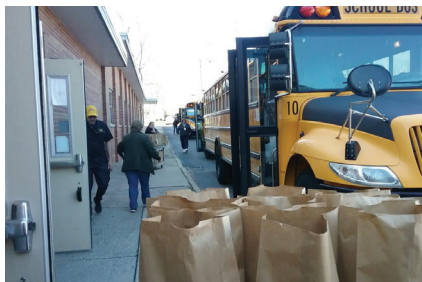
Volunteers loading buses with food bags.

The District is adding bus stop food pickup. On the following date: April 27, 2020 10:30am to 12:30pm. During this time, the District will be delivering one week's worth of breakfast and lunch to the following sites: