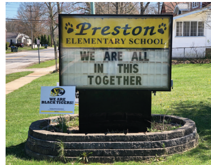
The sign at Preston Elementary shows its support for the community