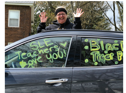
Silver Lake staff paraded around the Village and River Estates.

been busy these last few weeks with our new normal of online instruction. Working together, and in just three weeks, the staff has created a welcoming virtual environment with meaningful instruction and activities promoting emotional well-being.” One of the ways the Lincoln staff has been helping the Black Tiger family is by providing specific instruction for English learners, explaining how technology works, and where to find info and using various translation apps to communicate with their parents. Another way they are helping their students is creating activities for physical movement, art skills, and musical experiences. Creativity continues to grow. “Students are very proud to share their activities, talents, crafts, and drawings,” said Early.